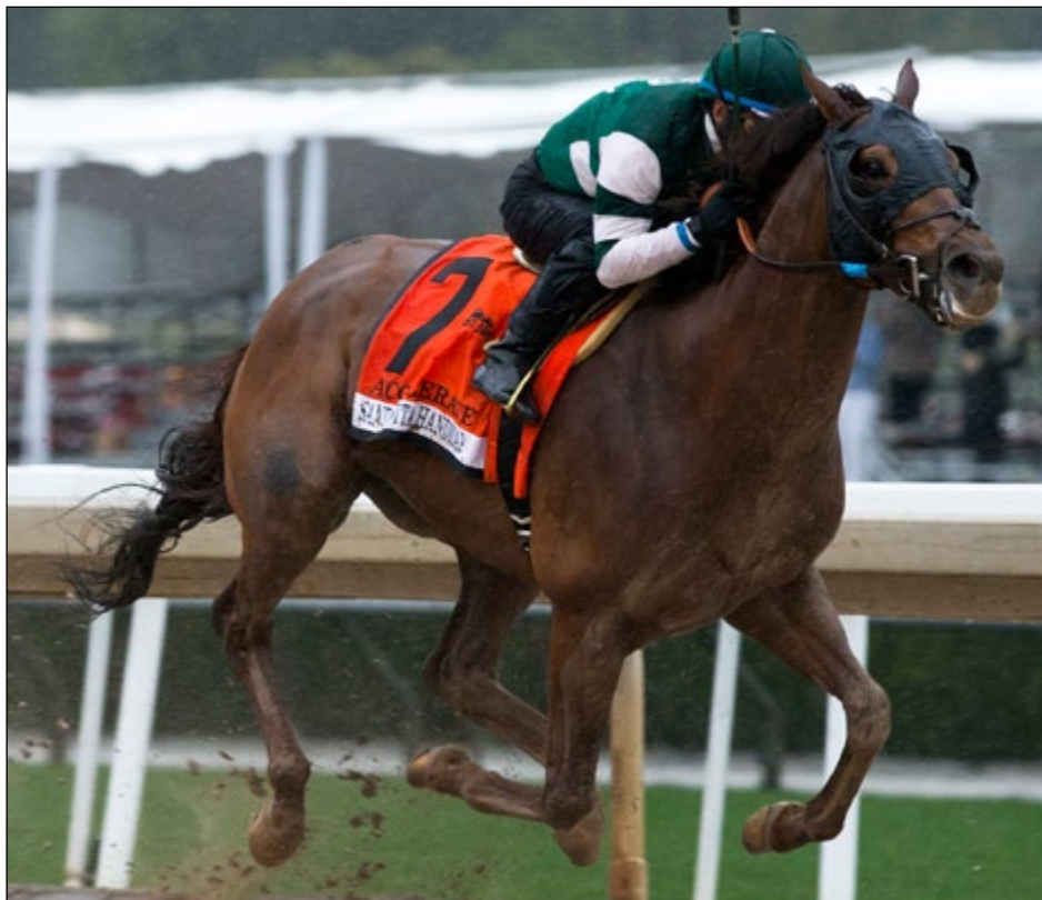
BARBARA D. LIVINGSTON

Sire: LOOKIN AT LUCKY . Raced 2 years, 13 starts, 9 wins. Earned $3,307,278. Best Beyer: 106 . Stands at Ashford Stud in Ky. for $17,500. Sire of 5 crops, 642 foals, 390 runners (61%), 271 winners (42%), 35 SWs (5%), including Madefromlucky, Breaking Lucky, Money Multiplier, champion Wow Cat (Chi). Total progeny earnings $21,854,290, $56,037 average per starter. Auction record, 1980 to present—232 yearlings sold, $61,401 average. In 2017, 32 yearlings sold, $56,484 average.